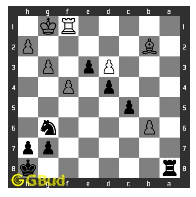
Figure 1.5: Rxa8 White Rook is captured

Now you can capture the white rook at a8 by moving the black rook from f8.