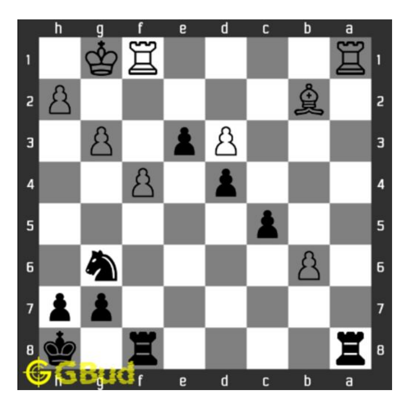
Figure 1.3: Rxa8 White Queen is captured

The queen is in the line of attack by the battery of Rooks. Capturing the queen by the rook from e8 to a8 (Rxa8) will result in the following board position .