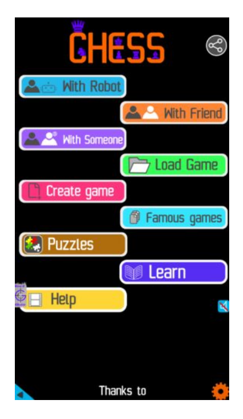
Figure 1.8: Play chess online for free. Solve puzzles and play with friends